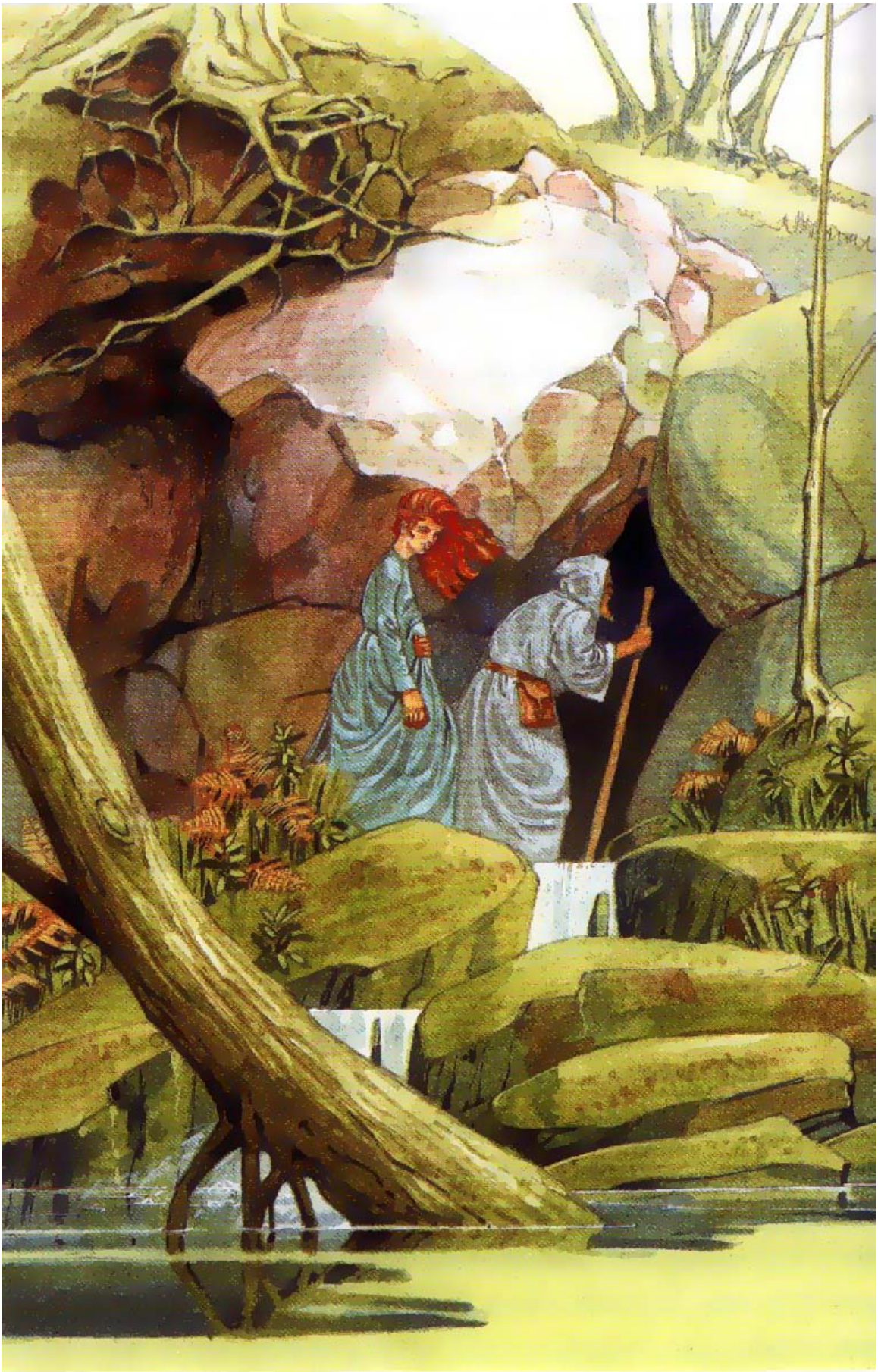
So Merlin went into the cave first.